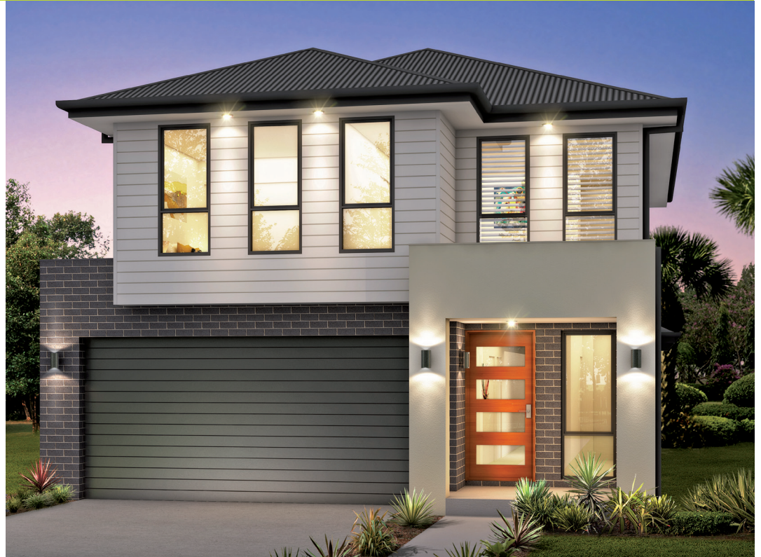
Image depicted is for illustrative purposes only and is not an exact match to plan. Please refer to Bellriver sales consultant for working drawings.